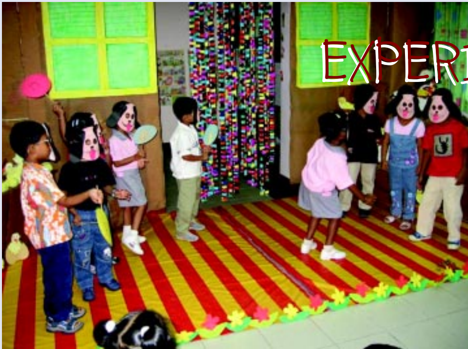
Learning through play acting