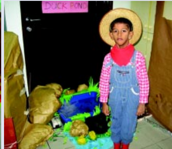
The "farmer" and his pond

The Trail took on a carnival atmosphere with its selection of delicious, kid-prepared snacks which the visiting adults were only too happy to help themselves to. Children got plenty of hands-on learning opportunities as they served food to the guests, ran their own handmade craft and souvenir stalls and presented short skits. Even the younger students from the Nursery classes were enthusiastically involved in the activities, making the Trail a memorable experience for both the tiny-tots and the adults.